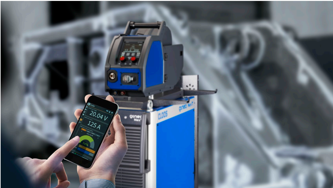
Photo 1: C-Gate now also offers a comprehensive online monitoring of the QINEO welding machines.

More information: https://c-gate.cloos.de/en/