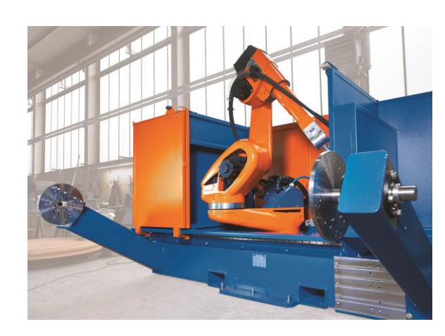
Picture 1: The new All-In-One system combines high productivity with optimum efficiency.