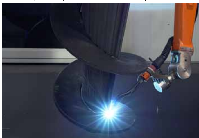
Photo 1: The robot welds the demanding radial seams of the screw compactor evenly and with consistently high quality.