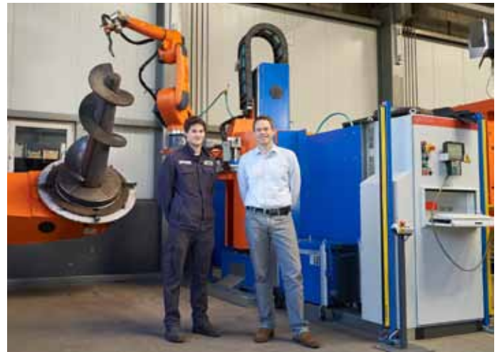
Photo 4: Because of the two-station design, the machine can be charged alternately – an enormous saving in time for the process run.

So far, one variant of the screw compactor has been welded using the CLOOS robot system. In the future, 70 per cent of the company's screw compactors will be processed by the new system, while further renovations and upgrades are planned for the entire production facility. "In the future, we will definitely use automated welding for other components, such as containers or stems," says Stolz. "We want to strengthen our site in the long term through innovation and investment."