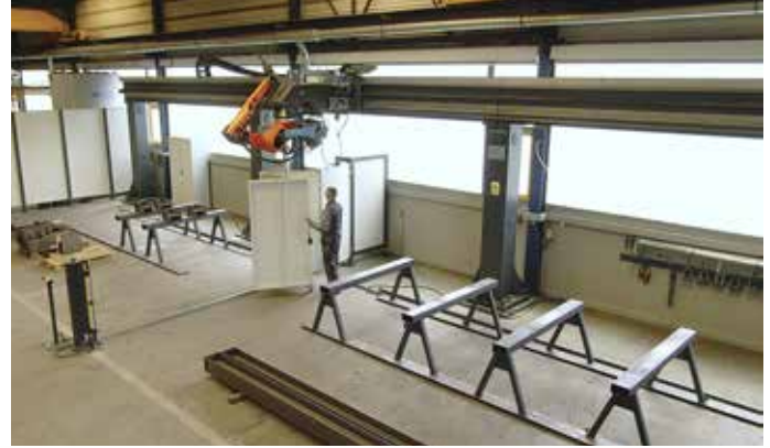
Photo 5: The system can be used flexibly in single or two-station operation.

The employees in the welding area were involved in the project from the very beginning. It was their first contact with a welding robot. In order to benefit fully from the innovative technology, they were intensively trained by CLOOS.