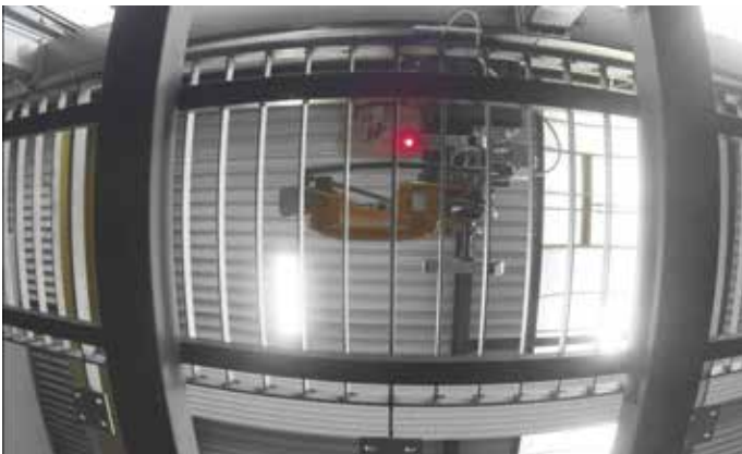
Photo 4: The scanner then scans the work surface of the component and detects the weld seams.

"The database is expanding every day, so we can weld more and more components with the robot," says Hümmer. "Everything is much quicker if we only scan briefly and then weld directly." In that time, we're already preparing the next part again."