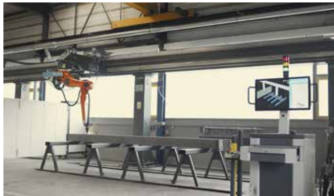
Photo 1: The new robot system is used to weld different components for steel and metal construction.

The company feels the shortage of skilled workers very clearly, also because of the location. Fewer and fewer qualified manual welders are available on the labour market. In order to counteract this development, to better absorb order peaks and to further increase the quality level the company decided to invest in a robot welding system in 2021. "The physically heavy and monotonous tasks can now be taken over by the robot and the operators have more time to concentrate on other demanding tasks and process monitoring," says Kern. "In addition, the general hazard and exposure to arc radiation and welding fumes is less."