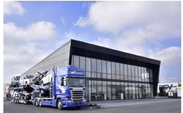
Photo 6: Example reference - a commercial building from Hörmann.