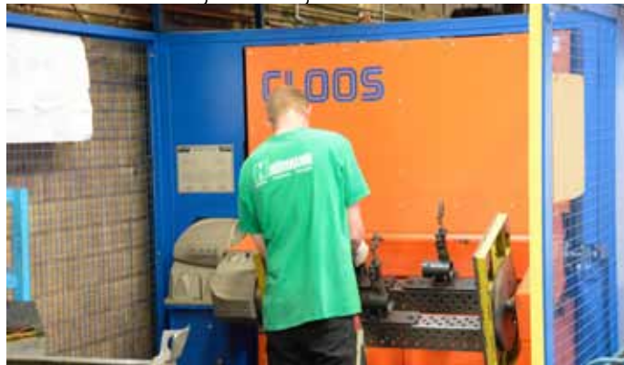
Photo 5: The operator can load one compact cell station whilst welding is performed on the other station on the robot.

Also, the fixtures can be used flexibly on both systems. "The part change possible between the systems means we can also guarantee our delivery times when one robot is already occupied", explains Schunn. "Before, we had to resort to manual welding in emergencies."