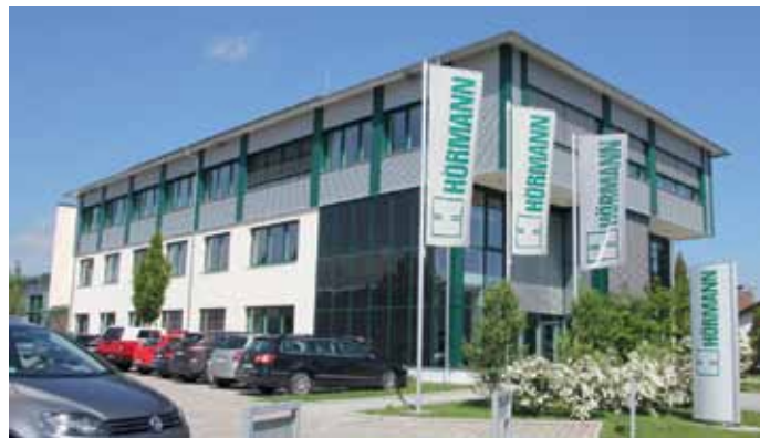
Photo 1: Head office of Rudolf Hörmann GmbH & Co. KG.