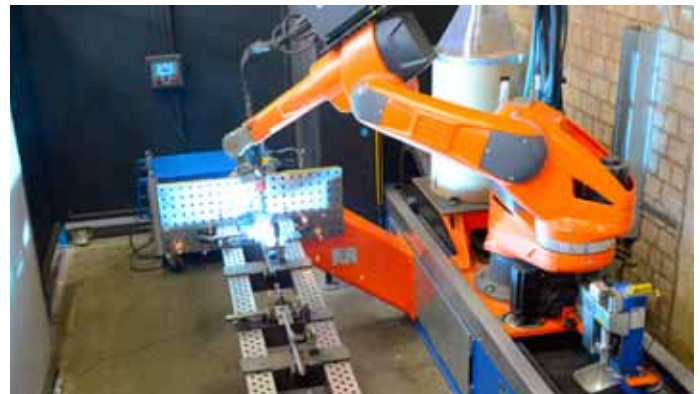
Photo 2: On the "All in one", all relevant components are positioned on a joint base frame.

speeds up the welding of the partly complex workpieces. While the robot is welding the components on one side, loading or unloading is carried out simultaneously on the other station. The movable counter bearing can be used to adjust the clamping lengths within range 2.5 to 3 metres.