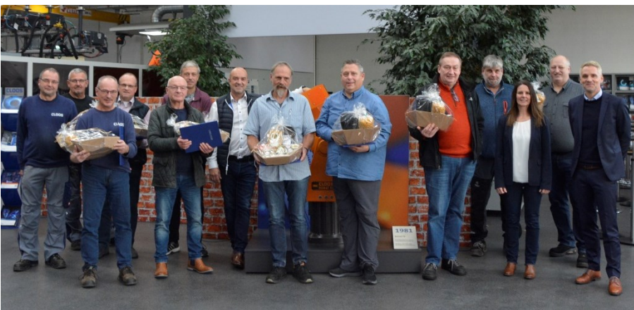
Photo 2: These employees have been loyal to CLOOS for 40 and 50 years.